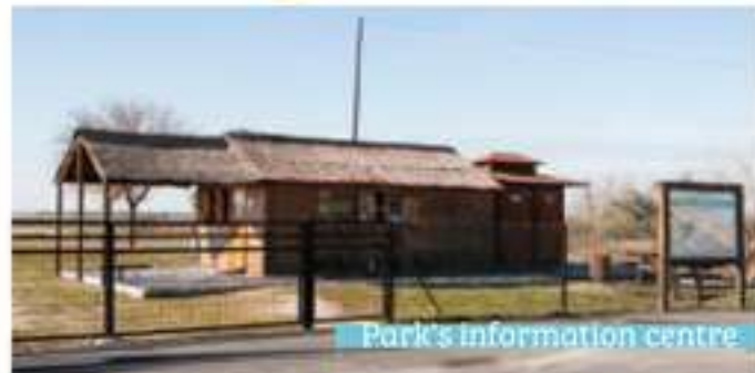
Park's information centre

Penduline tit Easy to recognise with its striking black face mask. It weaves extremely elaborate balloon-shaped nests.