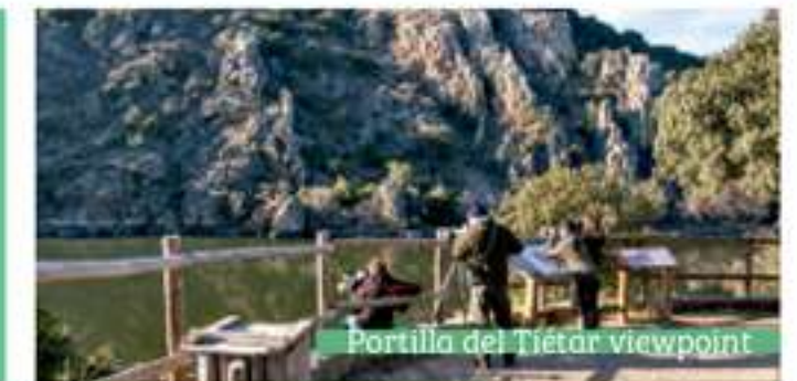
Portilla del Tiétar viewpoint

FIO, a European benchmark for bird lovers